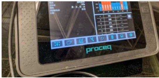
Data cable for hardness testing device. Free of hazardous substances according to RoHS2011/65/EU