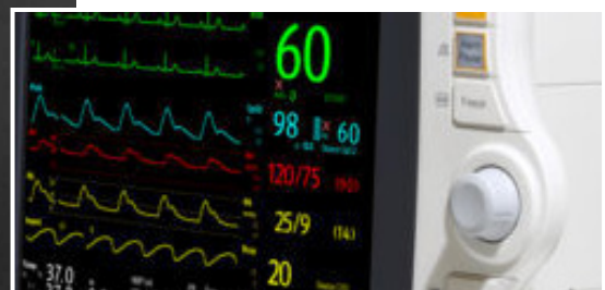
Spo2 extension cable. Free of hazardous substances according to RoHS2011/65/EU

The above are some examples from ex-projects, please contact our sales team to identify products from their model number. When ordering, use a model number from the table in Ordering Information.