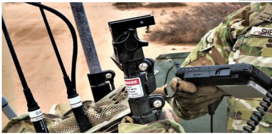
Military cable for communication station. Free of hazardous substances according to RoHS2011/65/EU