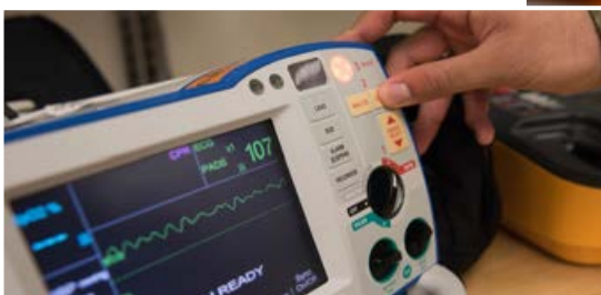
Military cable for patient monitoring system. Free of hazardous substances according to RoHS2011/65/EU